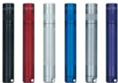
Black Red Silver Blue Gray Purple