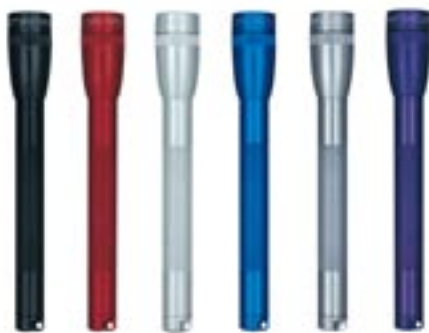
Black Red Silver Blue Gray Purple